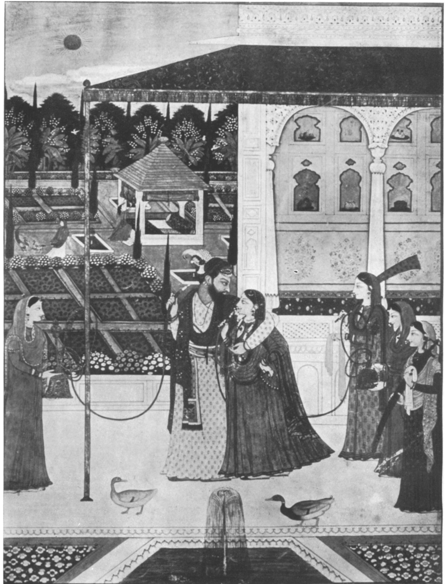
Plate 3 Raja Rāj Singh of Chambā Musée du Louvre

dress, with one of his Rāñīs walking on a terrace of his palace. They are attended by four ladies-in-waiting, two of whom carry the hookas 9 which both the Raja and his consort are smoking, while the others hold his sword and a peacock-fan (mōrchal). The princely couple are sheltered against the heat of the sun by an embroidered(?) canopy attached to an open pavilion. In the foreground there are two ducks walking along the edge of a square cistern enlivened by a fountain. The background is formed by a palace-garden laid out in