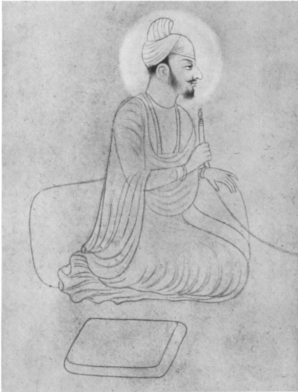
Plate 1 Raja Rāmsaraṇ of Hindūr(?)